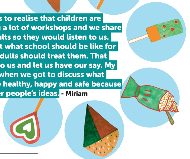
Image: Imagineers drew ice-creams to represent the summer holidays