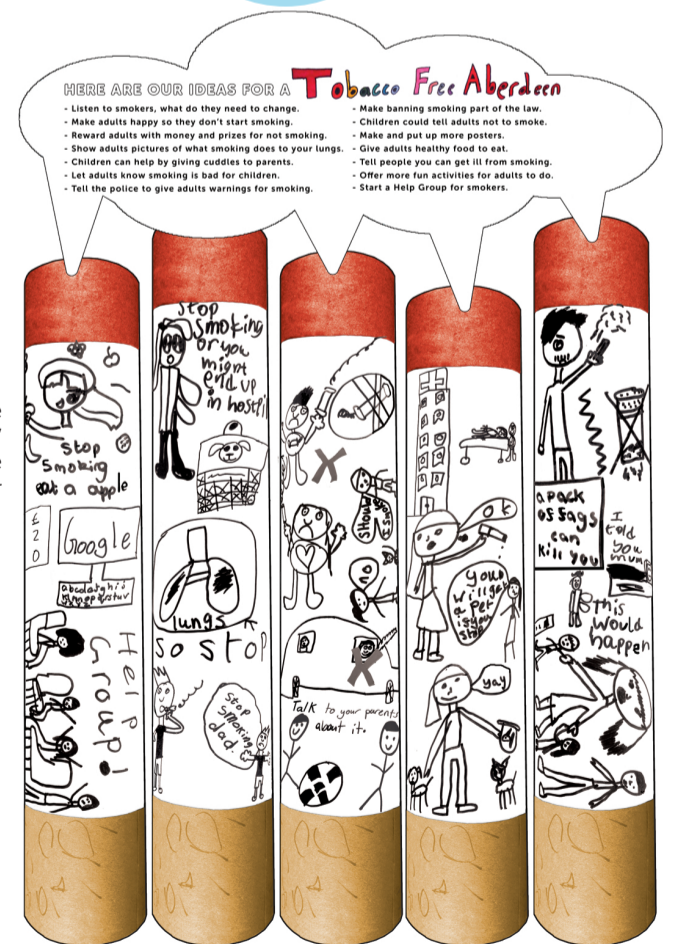
Image: The Imagineers' Tobacco Free Aberdeen Poster