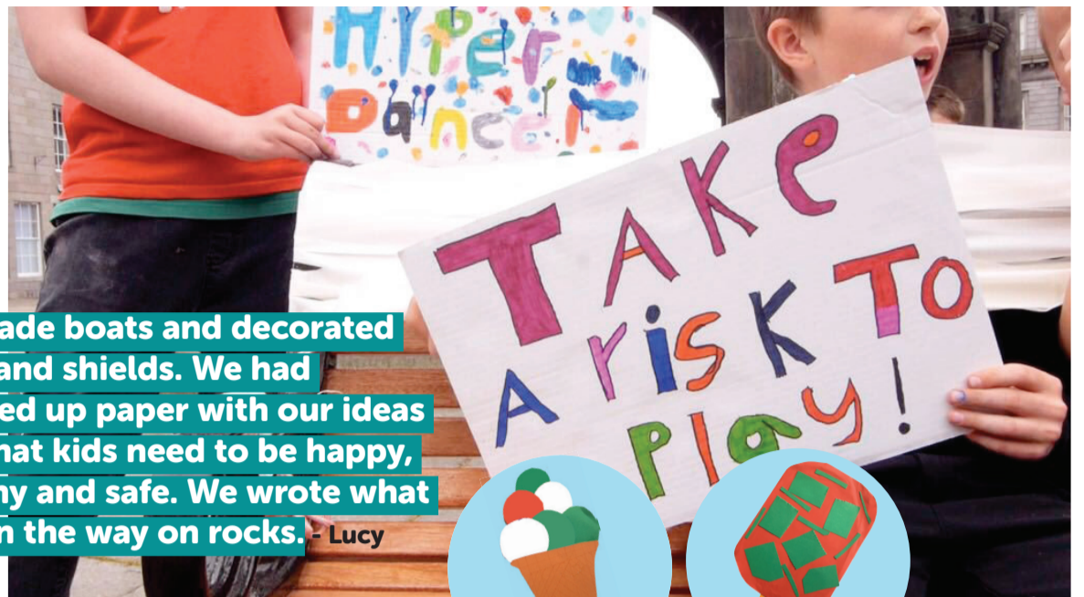
Image: Imagineers explore play as part of the Look Again Festival